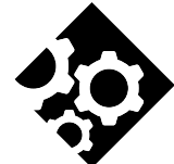
INDUSTRIAL & MANUFACTURING