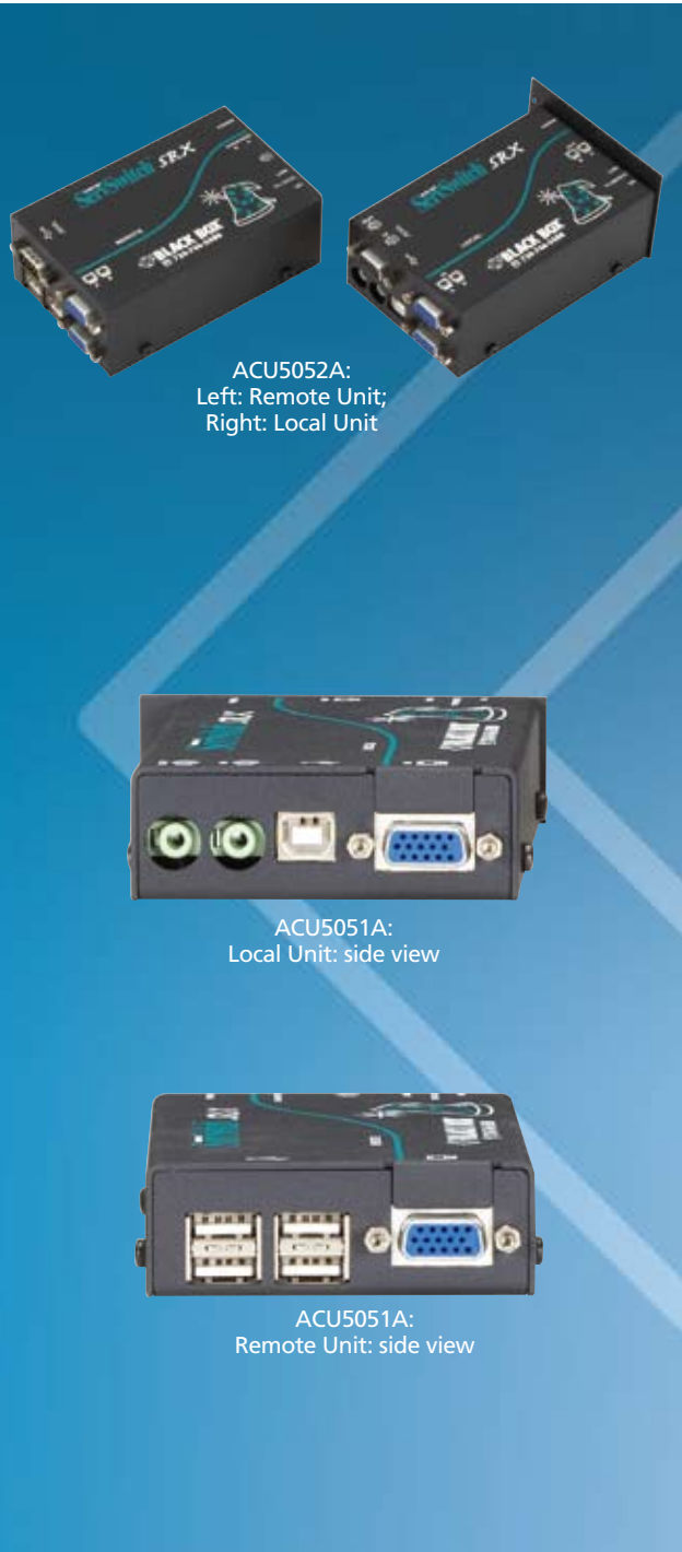
ACU5052A: Left: Remote Unit; Right: Local Unit