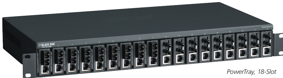
PowerTray, 18-Slot (LHC018A-AC-R2)

Optionally, you can mount up to 18 Multipower Miniature Media Converters in the PowerTray (part number LHC018A-AG-R2, shown below).