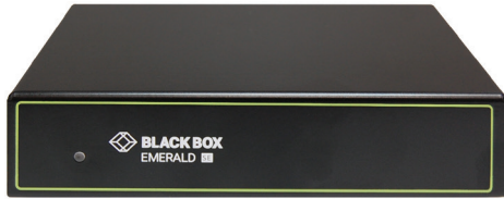
TRANSMITTER FRONT VIEW