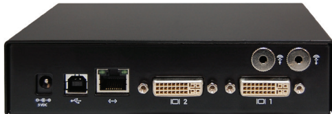
TRANSMITTER BACK VIEW