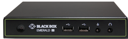
RECEIVER FRONT VIEW